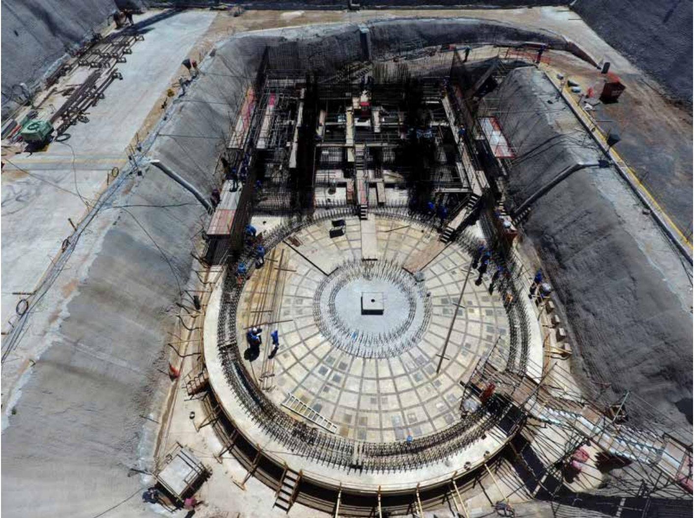
The CAREM SMR under construction in Argentina illustrates the gap between SMR rhetoric and reality. Costs have ballooned to US$21.9 billion / gigawatt.