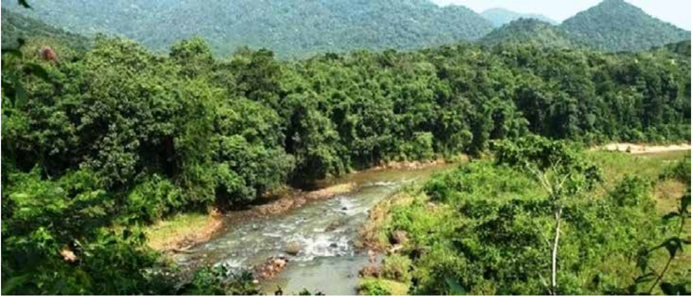
Amrabad Tiger Reserve in the State of Telangana, now vulnerable to uranium mining.

electricity through the nuclear route". For the exploration, it is estimated that nearly 4,000 deep holes will be required to be drilled 19 which conservationists argue will not only annihilate already endangered species of plants and animals, but also contaminate the surface and groundwater.