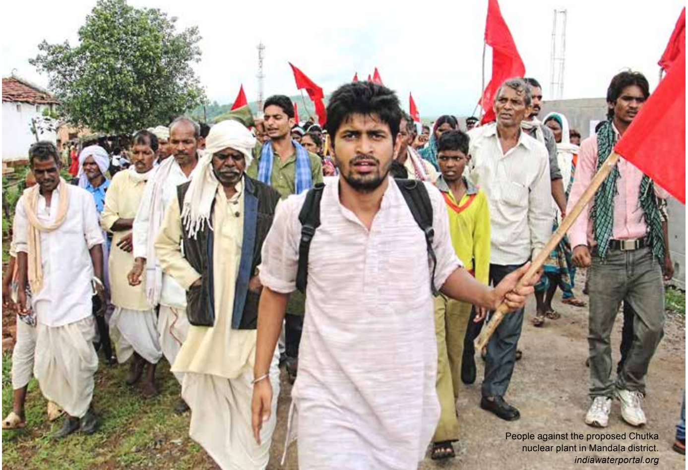
People against the proposed Chutka nuclear plant in Mandala district.

communities and industries will compete for the fast-decreasing water reserves of Narmada, and a massively water-guzzling nuclear plant on the bank of Bargi Dam will make the scenario much worse.