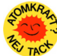
FMKK, Folkkampanjen mot Kärnkraft-Kärnvapen, Sweden