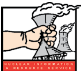
NIRS, Nuclear Information & Resource Service, USA